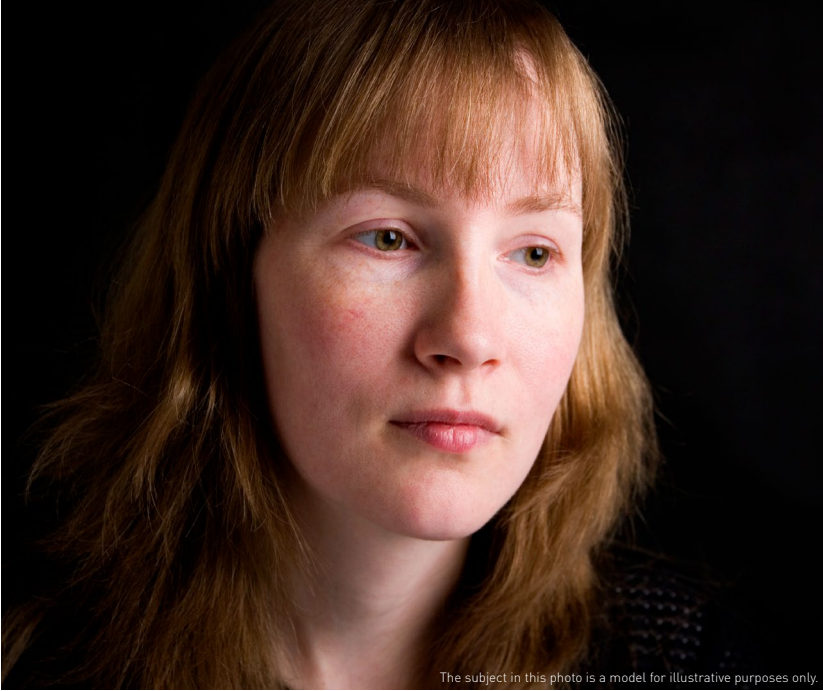
The subject in this photo is a model for illustrative purposes only.

Schizophrenia is a serious mental disorder in which people interpret reality abnormally —resulting in a combination of hallucinations, delusions, and exaggerated or irrational thinking and behavior. Less than one percent of people in the United States suffer from this illness.